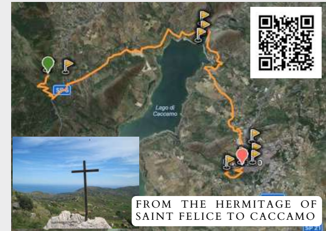
FROM THE HERMITAGE OF SAINT FELICE TO CACCAMO