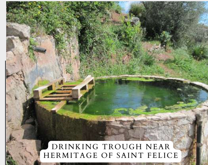
DRINKING TROUGH NEAR HERMITAGE OF SAINT FELICE

The "Via Francigena" Palermo-Messina is a path that crosses the mountains, unique and continuous, of about 400 km, which in 22 stops connects Palermo to Messina. The territory of Caccamo is crossed by two stops of the "Via Francigena":