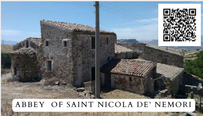
ABBHEY OF SAINT NICOLA DE' NEMORI