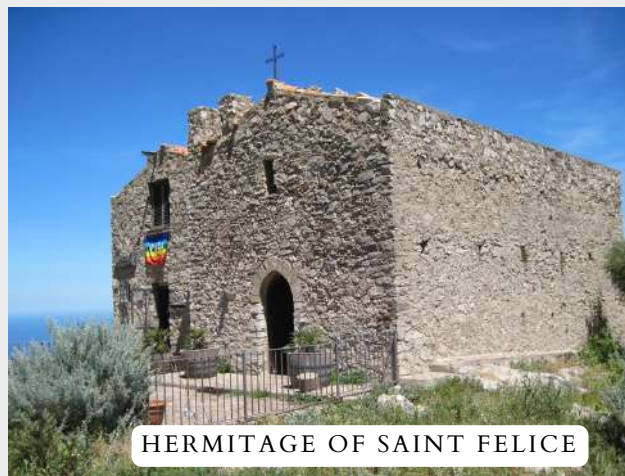
HERMITAGE OF SAINT FELICE