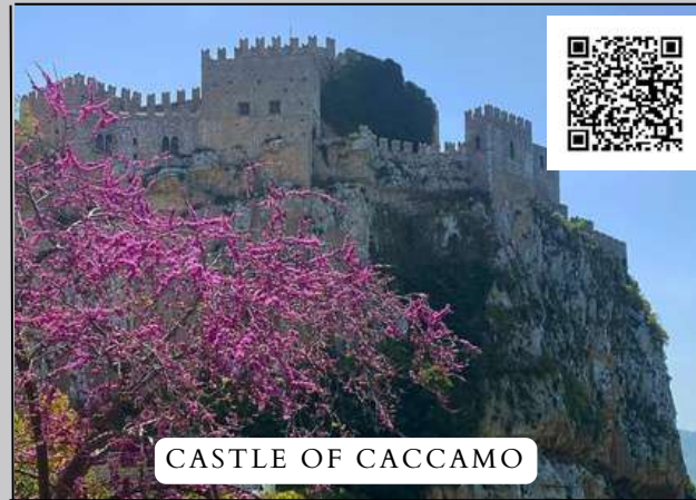
CASTLE OF CACCAMO

Path of Blesse Guglielmo is one-day trek on the steps of Blessed Guglielmo Gnoffi, begins from the medieval Castile of Caccamo, going down to the valley of the river San Leonardo and finally up to the "Hermitage of Saint Felice" (built by him around 1300), inside the "R.N.O. Pizzo Cane", "Pizzo Trigna" and Mazzamuto Cave.